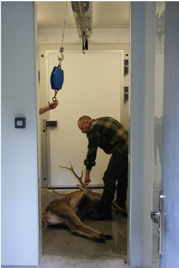
Larder facility at Slatach, Glenaladale.